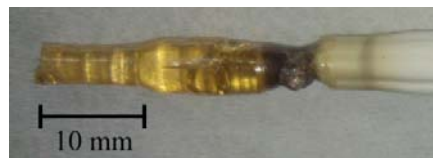
Figure 1. \text{SrY}_2\text{O}_4 doped with 5% of Ho.

Single crystals of \text{Sr}(\text{Y}_{1-x}\text{Ho}_x)_2\text{O}_4 doped with \text{Ho}^{3+} ions ( x = 0.002 and 0.05 ) were grown by the optical floating zone technique. \text{SrCO}_3 (Alfa Aesar, 99.99%), \text{Y}_2\text{O}_3 (Alfa Aesar, 99.99%), and \text{Ho}_2\text{O}_3 (Alfa Aesar, 99.9%) oxides were used as starting materials. The thoroughly ground and mixed stoichiometric composition was sintered at 1050 °C for 30 hours. Intermediate grindings were performed to obtain a homogeneous composition. The synthesized powder was analyzed by X-ray powder diffraction (XRD) on a Bruker D8 advance ( \text{Cu} , K\alpha_1 and K\alpha_2 ) diffractometer and was found to be a phase-pure material without traces of the of unreacted components or other impurities. The single crystal ingot was grown at a rate of 2 mm/h in an air flow of 0.5 l/min at ambient pressure using an optical floating zone furnace FZ-T-4000-H-VII-VPO-PC (Crystal Systems Corp., Japan) equipped with four 1 kW halogen lamps. Various growth speeds ranging from 1 to 10 mm/h were reported in the previous growth attempts [9]. We have found that growth rate of 2 mm/h led to stable melt zone and allowed to obtain crystal ingots without cracks.