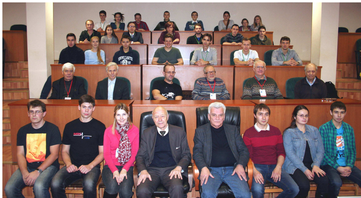
Figure 1. The participants of the International Youth Scientific School “Actual Problems of Magnetic Resonance and its Application”.