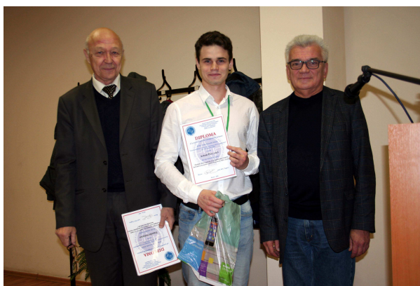
Figure 2. Award ceremony.

Now the XVIII School “Actual Problems of Magnetic Resonance and its Application” belongs to the History. Lectures, reports, questions, discussions remained in our memory. . . Let us wait for new meeting. . . The new generations of magnetic resonance spectroscopy researchers of Russia will be always welcome in Kazan.